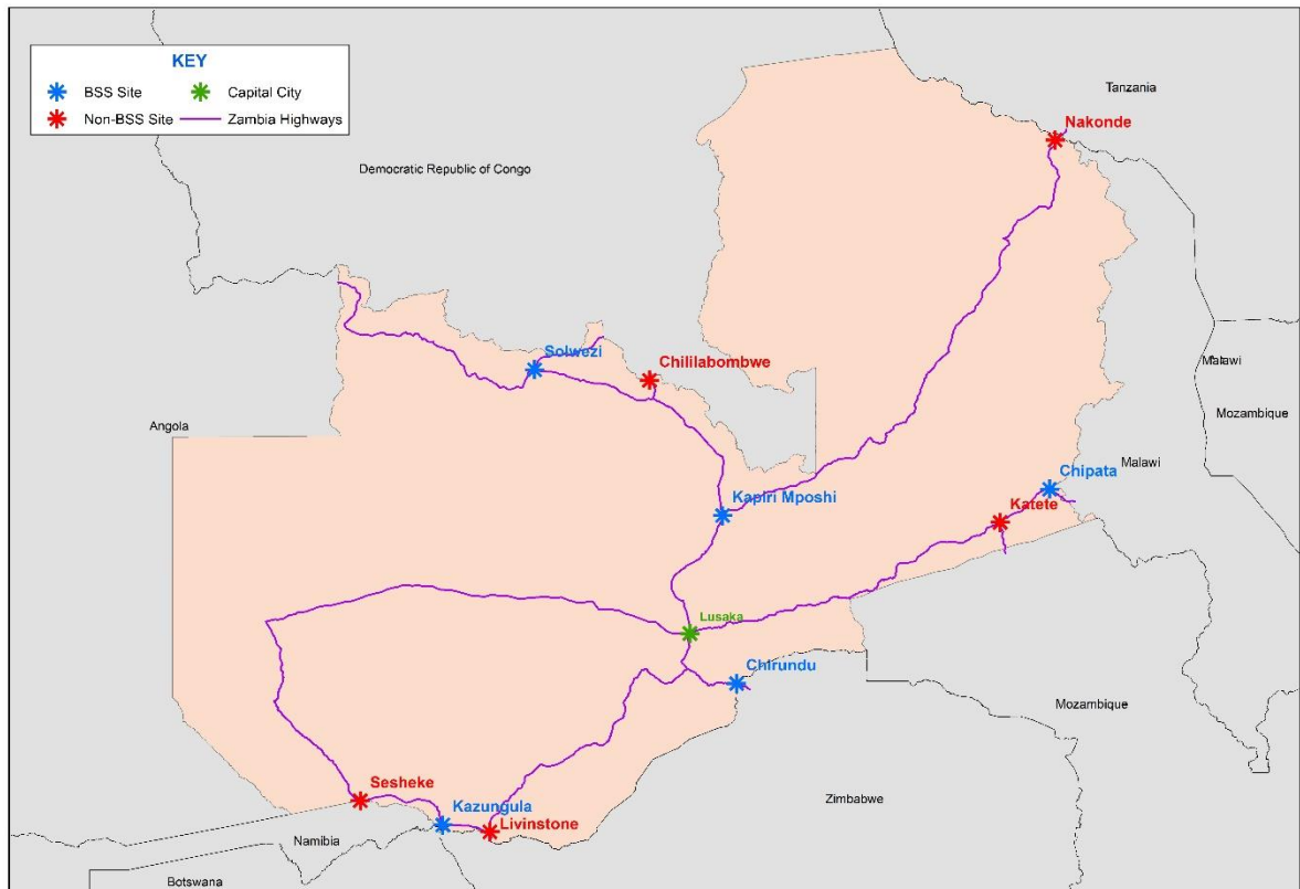
Figure 1: Map of Zambia showing the five 5 BSS Study sites